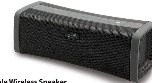
Portable Wireless Speaker User's Guide for Model No. ISB295 v1238-01